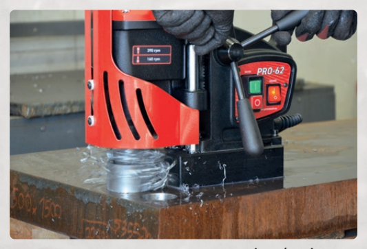
Milling capacity up to 65 mm (2-9/16")