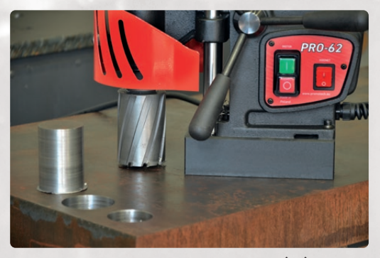
Max depth of cut up to 75 mm (3")