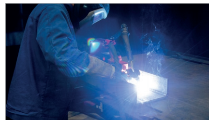
Welding in narrow spaces (min. width 200 mm)