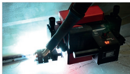
Torch placement on either side