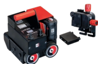
Universal cross-slide with torch holder and bracket are included in standard shipping set