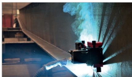
Welding edge to edge