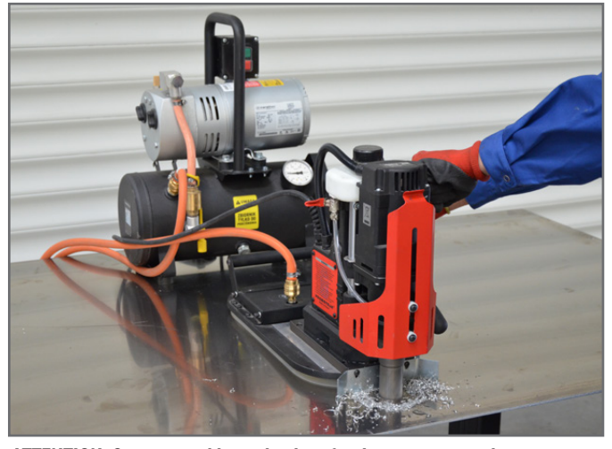
ATTENTION: Cutter guard is not in place for demo purpose only