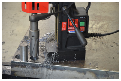
Milling capacity up to 55 mm (2.17") Depth of cut up to 75 mm (3")