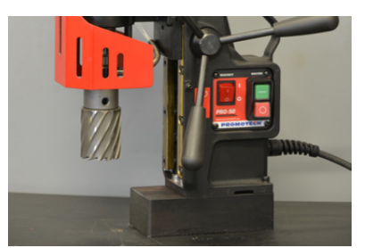
HSS cutters up to \Phi 45 mm