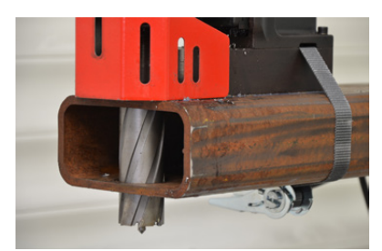
Starting point of milling up to 50 mm (2") below a level of a drill base