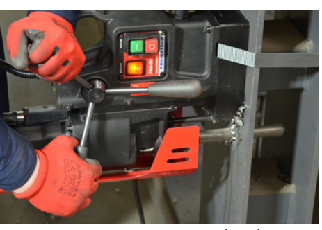
Drilling capacity up to 23 mm (0.91")