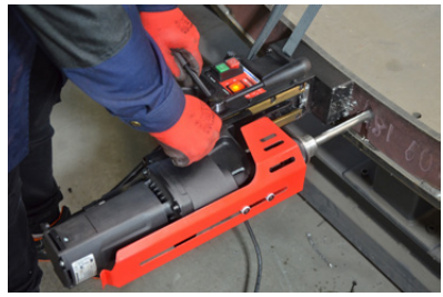
Out of position drilling