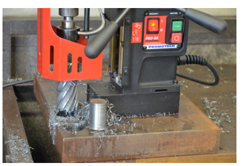
Milling capacity up to 50 mm (2") Depth of cut up to 75 mm (3") - option