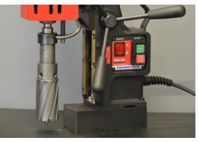
TCT cutters up to \Phi 50 mm with AMT2-C19/2-3 arbor D.O.C. up to 75 mm