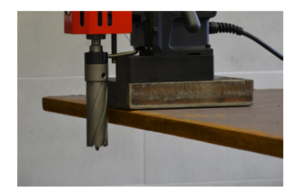
Starting point of drilling up to 50 mm below level of a drill base with 100 mm long cutter