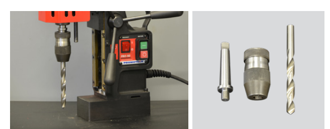
Adapter MT2 x 1/2" 20 UNF, Quick change drilling chuck 1/2" 20 UNF Twist drills up to \Phi 16.0 mm (DIN 338)