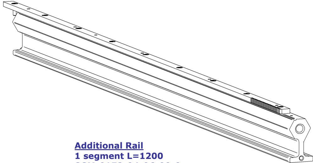
Additional Rail 1 segment L=1200 SGM-0152-04-06-00-0