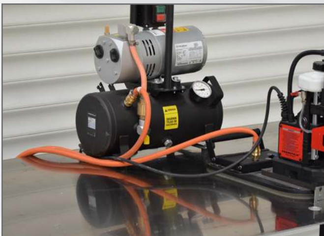
VACUUM SUPPLY (standard configuration)