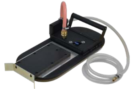
Vacuum pad equipped with compressed air ejector