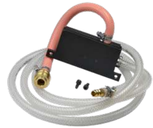
Compressed air ejector ZSP-0587-11-00-00-0

Optional compressed air ejector generates a vacuum thanks to high flow speed of air according to the Bernoulli principle. The vacuum pad equipped with the compressed air ejector can be an effective solution in numerous industrial plants and workshops, where compressed air pipe system is widely utilized.