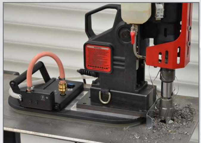
COMPRESSED AIR SUPPLY (optional configuration)